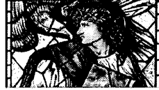
The Gospel of John

The Seton Scripture Series has one class left on the Gospel of John on Thursday: March 22 . The class is held in the Parish Hall from 6:30 PM until 7:45 PM.